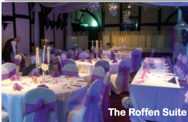
The Roffen Suite