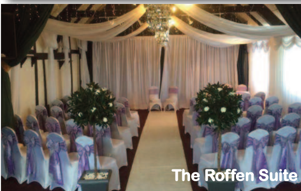
The Roffen Suite